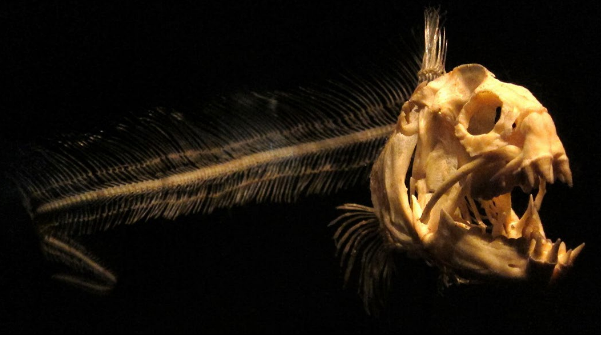
Skeleton of wolffish, showing its impressive teeth (above); Wolffish with prey (right)

of their egg yolks. They do have a larval stage and will float amongst that planktonic soup for a couple of weeks before settling onto a nice rocky seabed. Juveniles are olivebrown in colour with their pectoral fins being a shade of olive green. Adult females are usually more brown in colour, with the males a steely, purplish grey, with darker vertical bands down the length of the body.