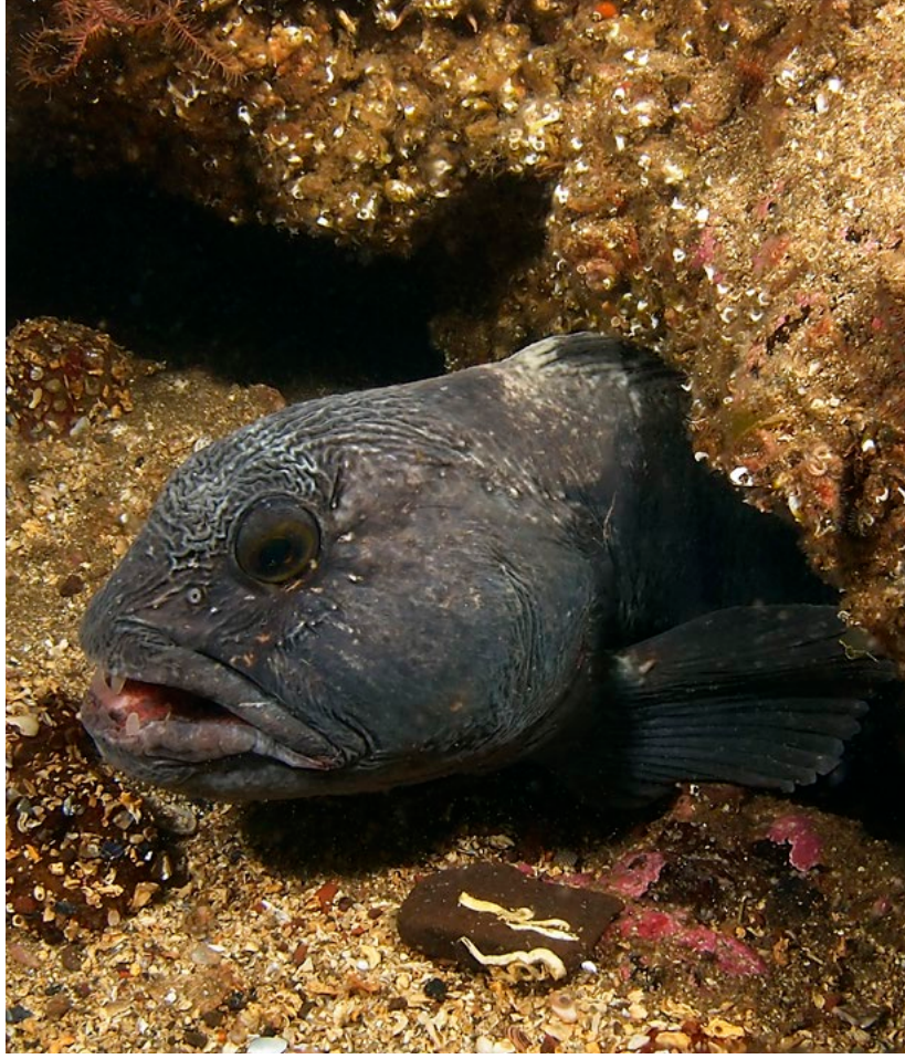
Eel pout, Newfoundland (left); Wolffish in its den (above)

I am not sure whether the coldwater habitat has anything to do with the super-sizing of species, but when I visited Newfoundland, there is a species of eelpout that is equally as large as the wolffish, but not nearly as ferocious-looking, as it has large fleshy lips, not unlike the European eelpout or viviparous blenny (Zoarces viviparus). The term viviparous means "to bear live young." The species found in Newfoundland is known as the large eelpout or Arctic eelpout (Lycodes lavalaei).