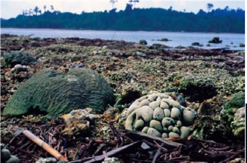
Some corals outside of the water

fish and 80% of the butterflyfish) recorded in the sites most affected by a strong siltation. This is unusual. Many fish species appeared in their recruitment stage, while many adults have been likely killed or displaced by the tsunami.