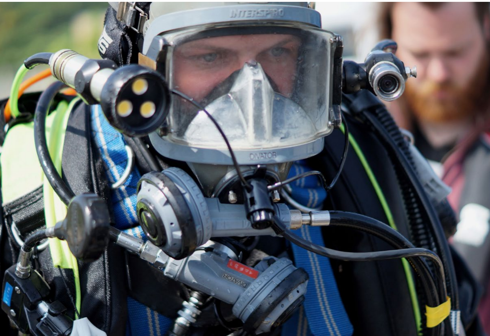
Diver readies for another training dive.