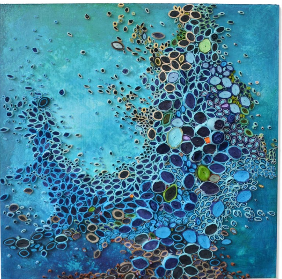
Sea Kelp #1, by Amy Genser Paper and acrylic on masonite, 25 x 25 x 2.5 inches

Sea Kelp #2, by Amy Genser Paper and acrylic on masonite, 25 x 25 x 2.5 inches