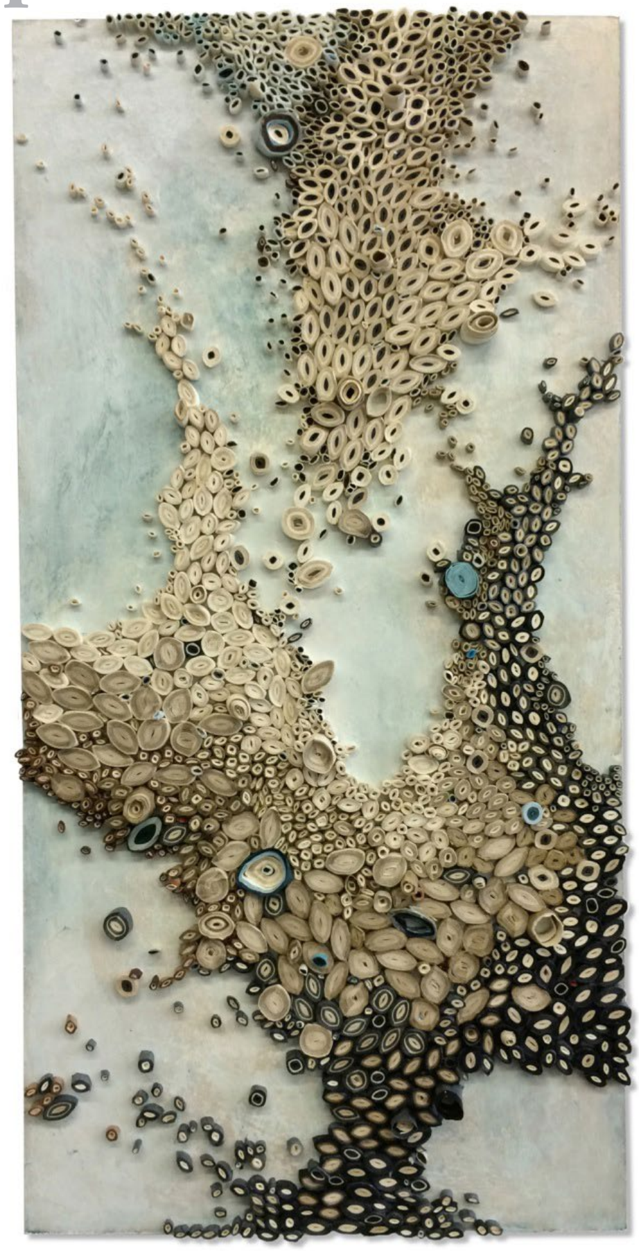
Everlasting Urchin, by Amy Genser Paper and acrylic on masonite, 18 x 36 x 1.5 inches