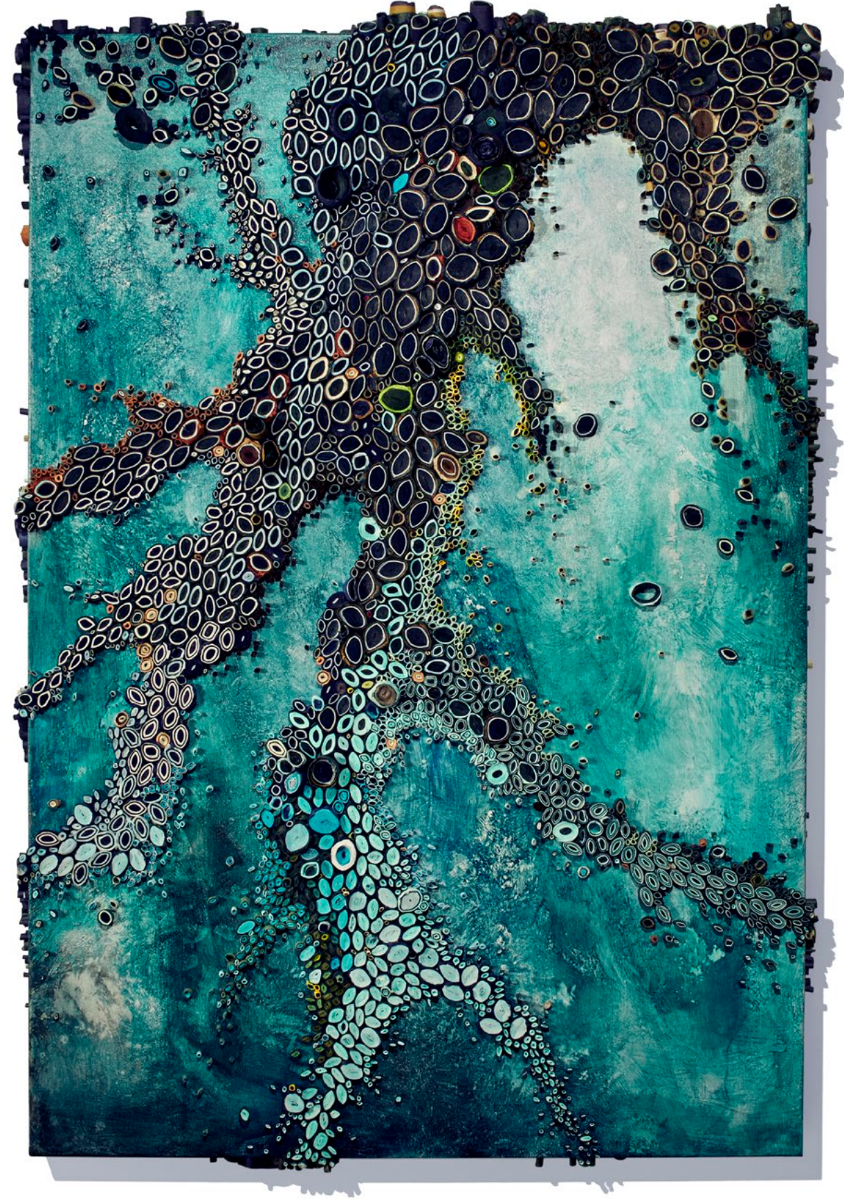
Swish, by Amy Genser Paper and acrylic on masonite, 36 x 54 x 3.5 inches

For more information, visit the artist's website at: www.amygenser.com. Or go to her Facebook page at: www.facebook.com/amygenserstudio