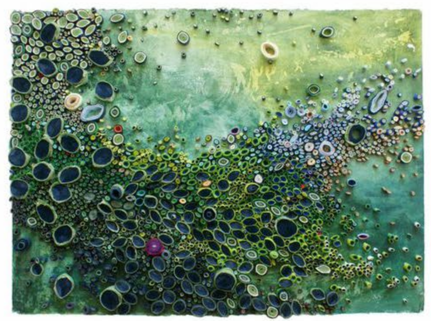
Sea Glass Three by Amy Genser Paper and acrylic on masonite, 24 x 32 x 1.5 inches each

X-RAY MAG: What are your upcoming projects, art courses or events?