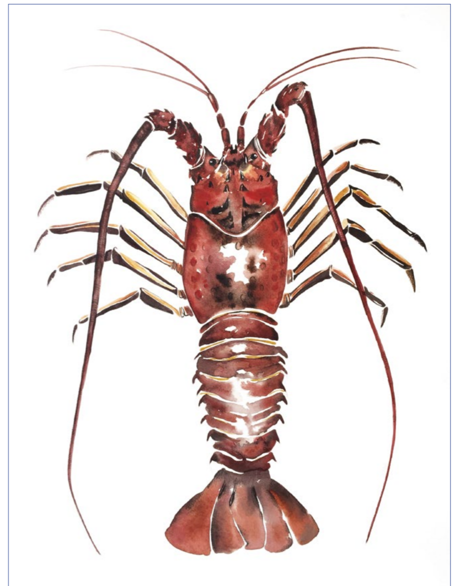
Spiny Lobster , by Kelly Clause. Watercolor on paper, 15 x 22 inches