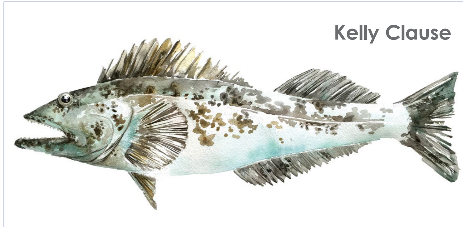
Lingcod, by Kelly Clause. Watercolor on paper, 22 x 16 inches

to halt. Not it the direct for the material art, but continu-me, hum-allows of "re-refreshes