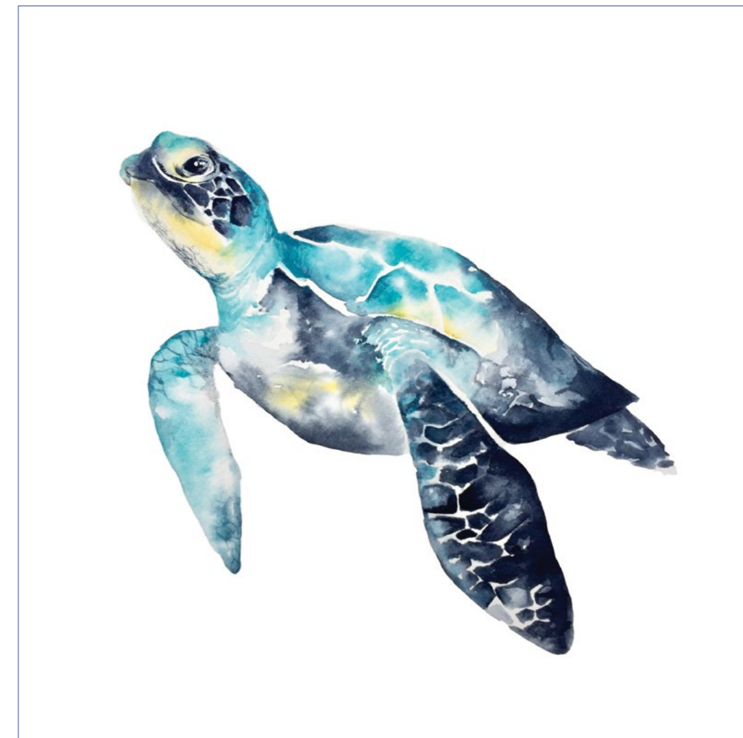
Hawksbill Turtle, by Kelly Clause. Watercolor on paper, 11 x 14 inches

Another unforgettable experience was off of Nusa Penida at the famous Manta Point. The sloped seafloor makes for excellent viewing grounds to watch the resident population of reef manta rays go about their business at their relatively shallow cleaning station. We were lucky to hit it on a great day. Conditions were perfect: There was good visibility and about 30 manta sightings in the span of our dive. To watch them swooping effortlessly through the water above and below and all around us, I felt like I was in the middle of a life-sized snow globe. Pretty majestic.