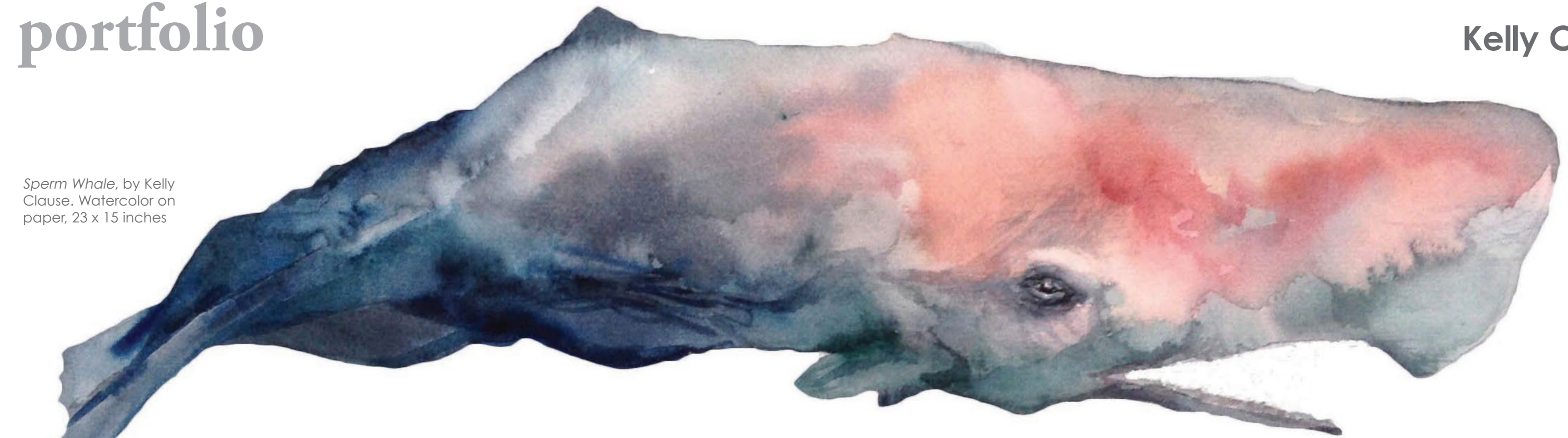
Sperm Whale , by Kelly Clause. Watercolor on paper, 23 x 15 inches

card of mine and proceeded to draw a strikingly similar version of his own whale in his sketchbook. He ran back to my table repeatedly, grabbing more of my sea creature cards as bits of inspiration for what became an entire underwater mural on the side of a nearby wall.