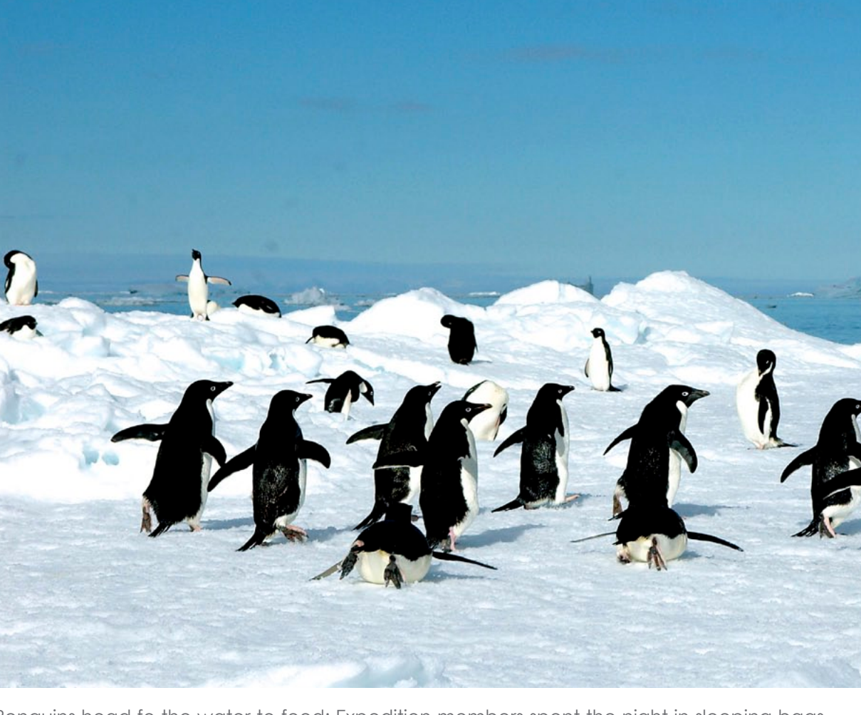
Penguins head to the water to feed; Expedition members spent the night in sleeping bags on solid ice; Chinstrap penguins keep close bonds with their young

The mere mention of Antarctica triggers the imagination and evokes stunning images of a majestic frozen continent laden with resident penguins, polar bears and whales. In the real world, there are no polar bears in the Antarctic, and there are no penguins in the north Arctic. Though both the Antarctic and Arctic are high latitude, freezing polar regions, the similarities end there. The enormous Antarctic is an un-colonized continent covered with ice, whereby the north Arctic is comprised of a frozen ocean at the North Pole, surrounded by land masses to the south of which some are heavily populated by humans.