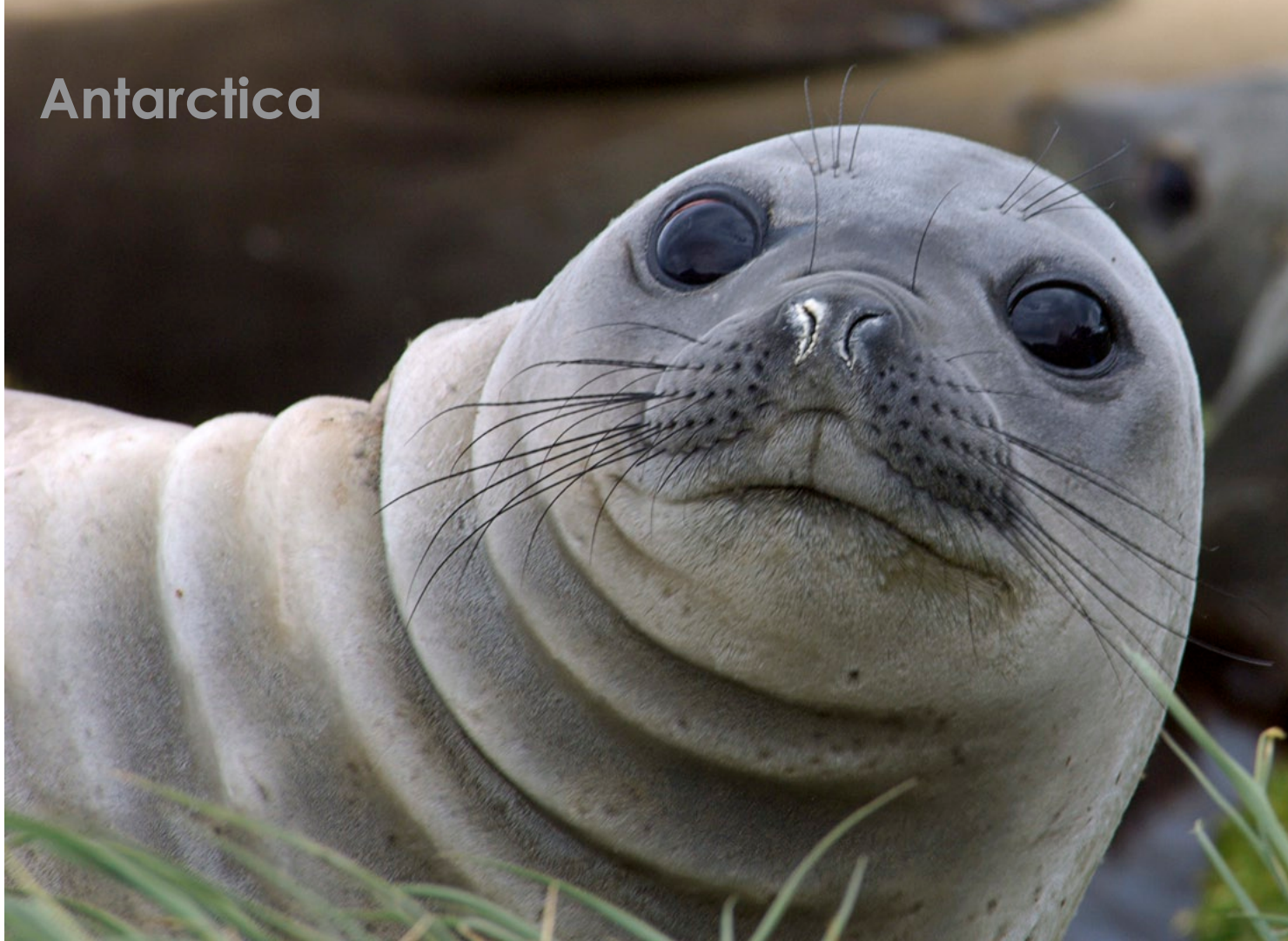
Adelie penguin (Pygoscelis adeliae) peeks into the camera; Common seal raises his head; Colony of Emperor Penguins

floated on mirrored waters like roughcut diamonds sculptured by artisans from heaven. Antarctica fulfills the childhood dream of adventure, exploration, and fantasy with its ethereal landscape. It shimmers with a savage beauty, unique wildlife and raw power exceeding any expectations. The term, immense , took on a new-found significance, as I obstinately attempted to freeze the moment onto film. I could only try.