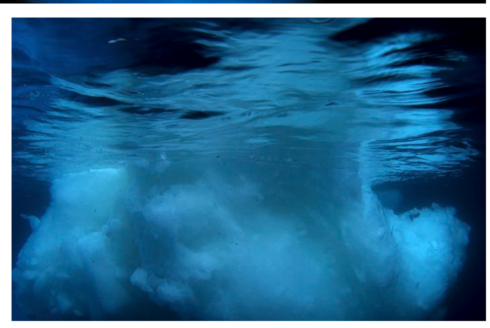
Views of icebergs from under and over the water's surface