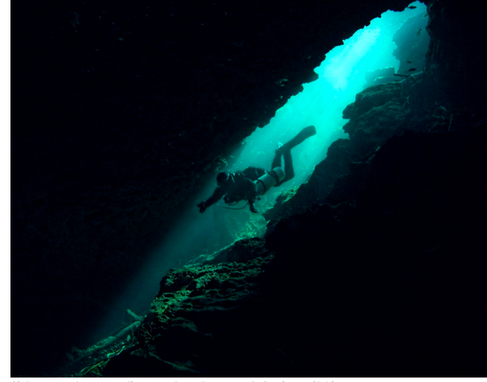
Sidemount cave diver enters Peacock Springs (P1)

Much of the water travels down through the Floridan Aquifer by way of rainstorms passing through Georgia and territories to the north. The relationship between these two regions can be unpredictable