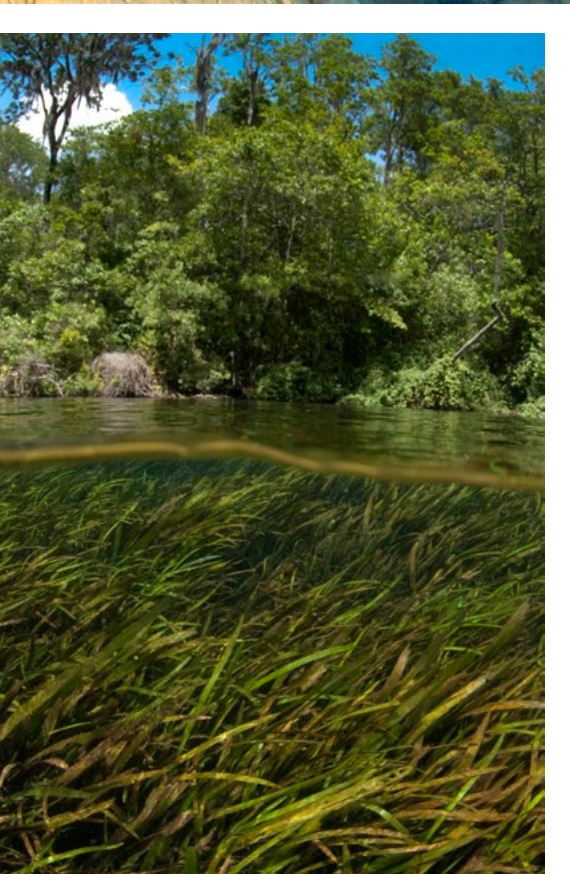
Rainbow River, Florida