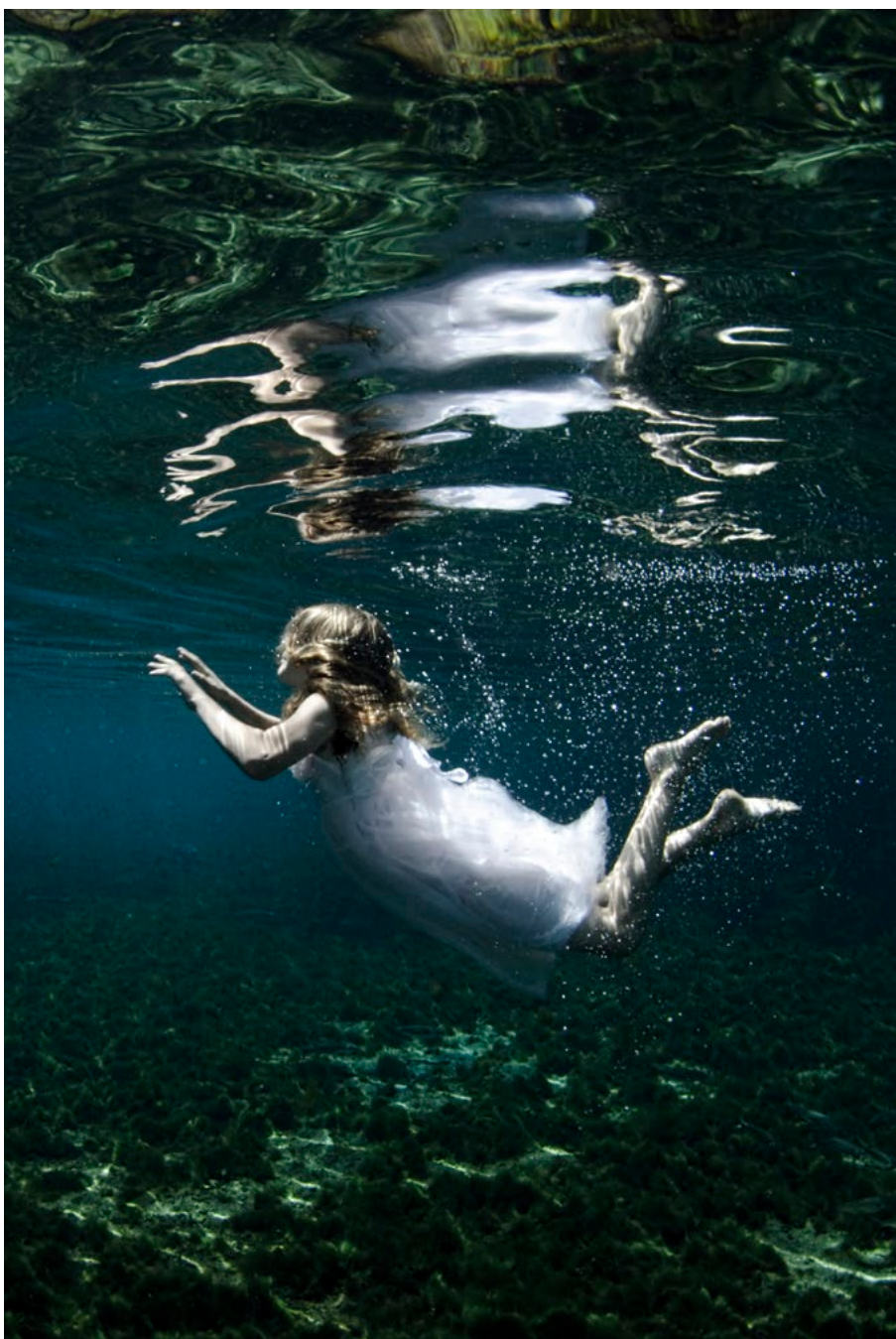
A young girl plays underwater (above); Florida Springs offer recreation and retreat for locals and visitors alike. Cave diver (left) exits Jackson Blue, a system found in the Mill Pond at Marianna, Florida

The Florida Springs are jewels. Overflowing with life, the springs offer refuge to a multitude of animals including reptiles, freshwater fish, migrating and resident populations of birds, and local Floridians.