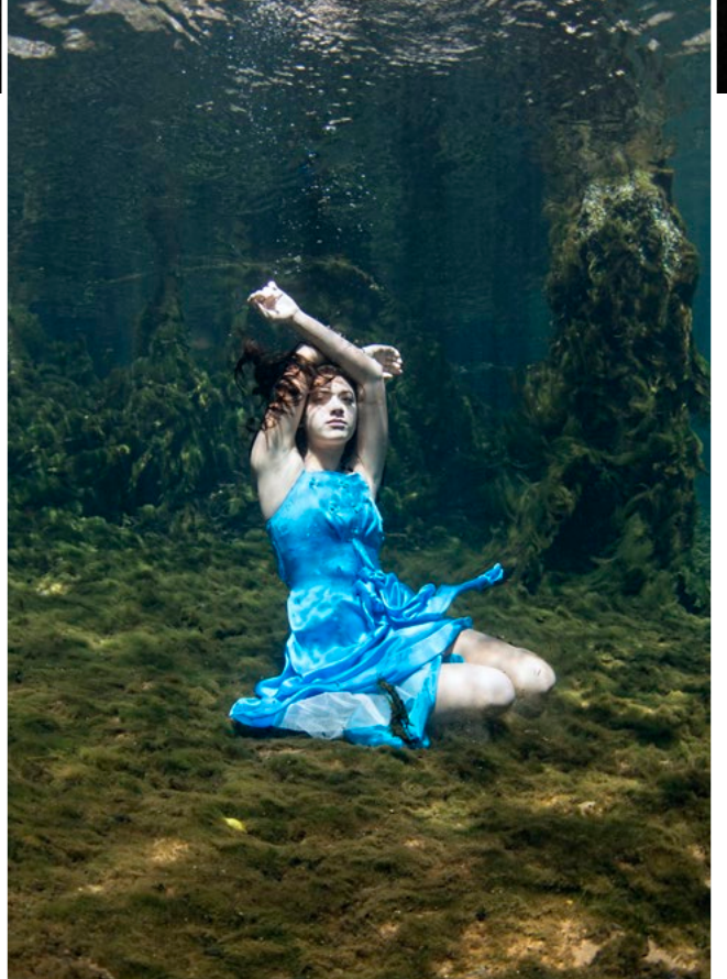
THIS PAGE: Underwater photos of freedivers the Floridan Aquifer in the gin-clear waters of the Florida Springs, from the "Florida Gems" art project